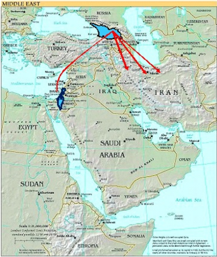
Israeli attack routes to Iran thru Georgia air base.

Israel had been helping Georgia, and as a benefit had been allowed to use a Georgian airfield for Israeli military aircraft. We now know that Israel had been planning to use the airfield as a refueling site for a planned attack on the Iranian nuclear facilities. Russian military forces captured that base, and still hold it.